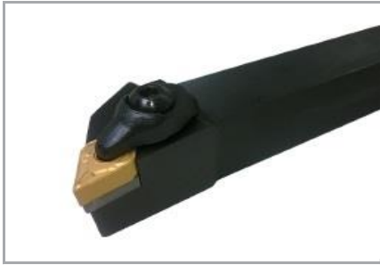
Right hand shown